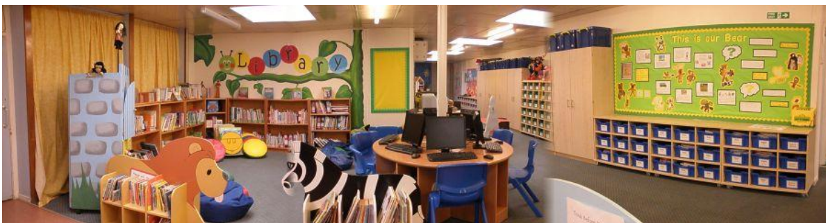
Northway Infant School, Gloucestershire